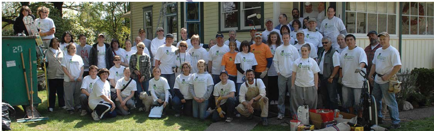
Lane Powell’s “Rebuilding Together” Project

We strive to lead the way in daily efforts to reduce our environmental impact. As a result, Oregon Business magazine named Lane Powell among the “100 Best Green Companies to Work For in Oregon.” We also host the legal news blog “Sustainability and Climate Change Reporter.” Visit our Sustainability Blog.